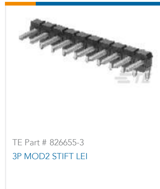
TE Part # 826655-3 3P MOD2 STIFT LEI