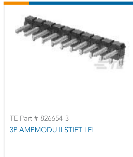
TE Part # 826654-3 3P AMPMODU II STIFT LEI