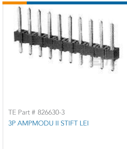
TE Part # 826630-3 3P AMPMODU II STIFT LEI